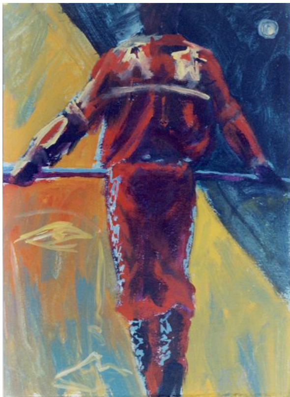
Painting by Allan Black

I've seen the dark-side When I'm trying to find the light Seen the shadows fade away On the wrong side of night Heard a song coming through And when I'm looking for you, I sing blue Too long on the dark-side Trying to find the light